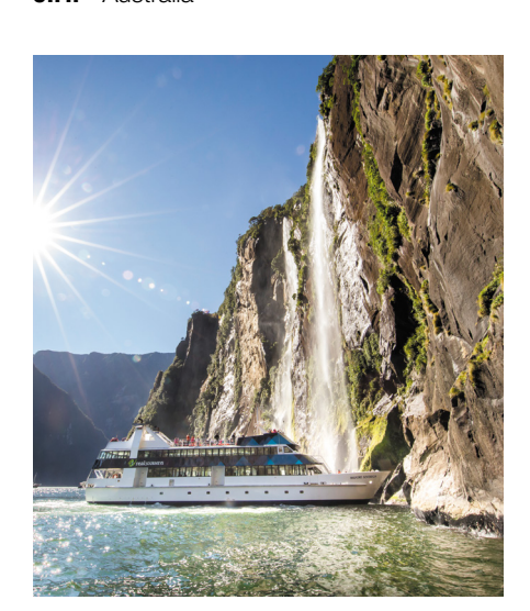
Tour Highlight: The Milford Sound Cruise and Lunch.

Explore the landscapes of the spectacular South Island