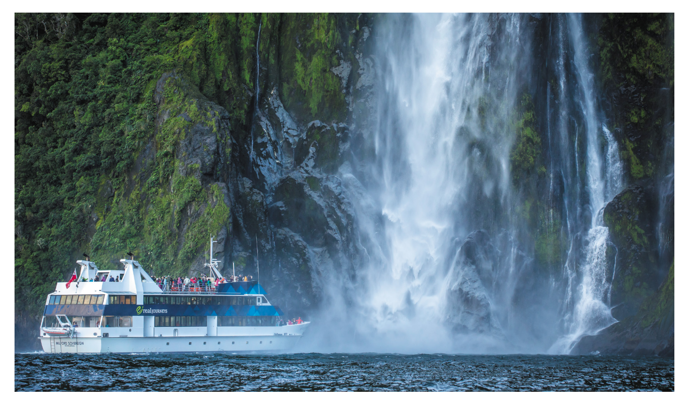
Board your launch for a cruise on the magnificent Milford Sound. See the spectacular Bowen Falls and towering Mitre Peak as you enjoy lunch onboard.