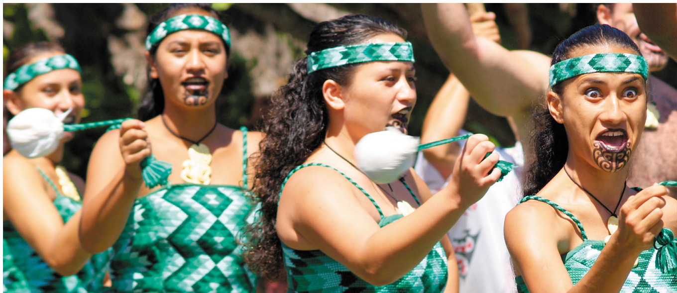
In Rotorua enjoy a Māori cultural performance which features the graceful poi dance.