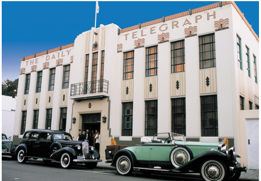
Enjoy an overnight stop in Napier, known as 'The Art Deco Capital'.