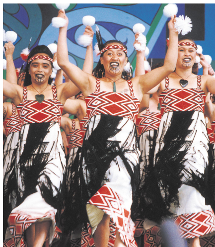
Feel the spirit of the Māori culture and traditions.