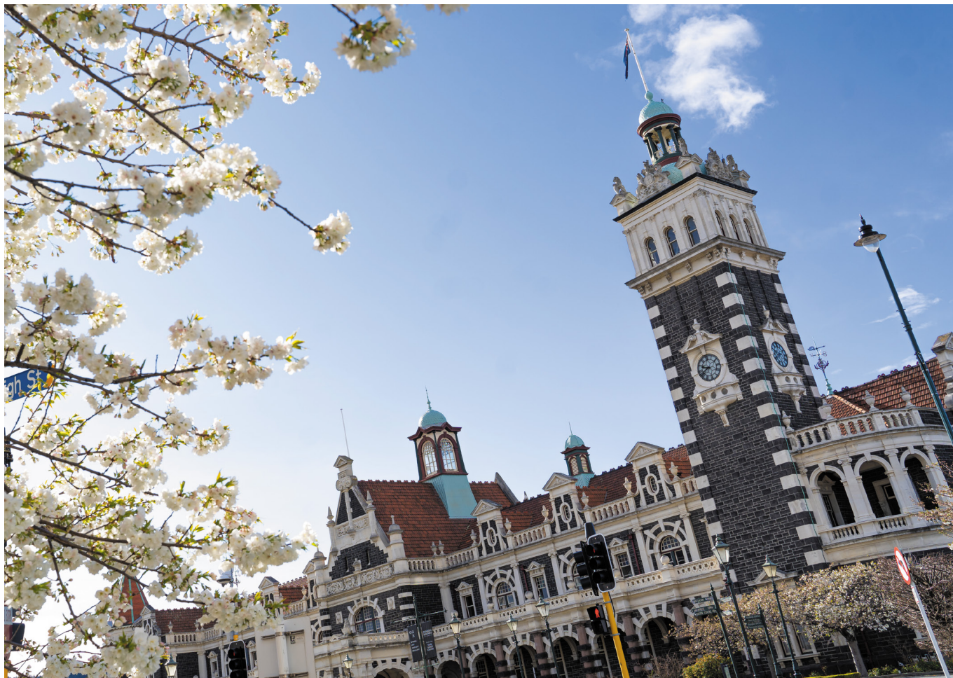
Enjoy time to wander around Dunedin's Edwardian and Victorian architecture.

Your Coach Captain is available to help you choose from the many optional activities available. This evening is also free to dine at one of the many fine restaurants.