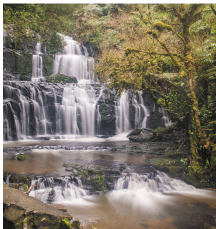
Visit the triple-tiered cascading waterfall at Purakaunui, part of the remarkable region of The Catlins.

An ultimate collection of the finest South Island experiences