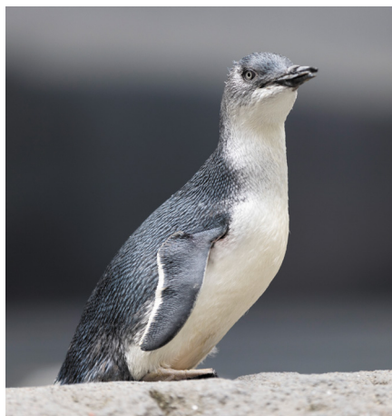
Wildlife at International Antarctic Centre.

Tour includes transfers in New Zealand, Business Class 20 seat coach travel, 4.5 star accommodation, most meals, sightseeing, attractions and a range of VIP extras.