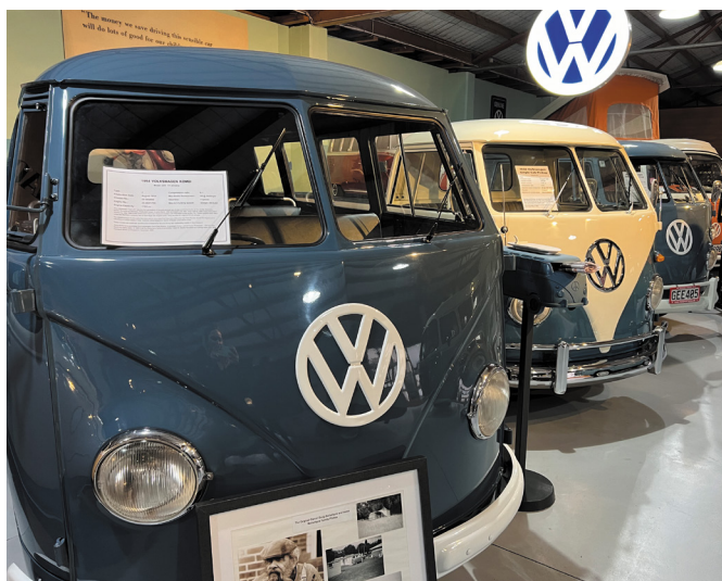
Explore vintage vehicles and transport history at Bill Richardson Transport World.

Experience the breathtaking beauty of Queenstown with an unforgettable three-night stay. Nestled on the pristine shores of Lake Wakatipu, this alpine paradise offers breathtaking scenery, thrilling outdoor activities, and vibrant nightlife. Discover the region's renowned vineyards, historic mining towns and picturesque streets. Savour gourmet dining and unwind in luxurious accommodations while surrounded by majestic mountains.