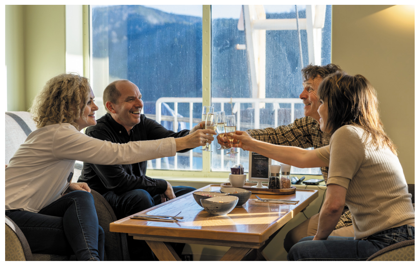
While aboard the Interislander Ferry you will experience the comfort and intimate setting of the Premium Lounge.