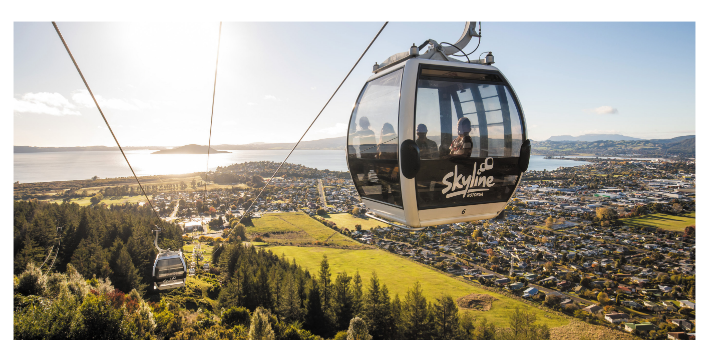
Enjoy the surrounds and activities on offer at Skyline Rotorua Gondola and Luge.