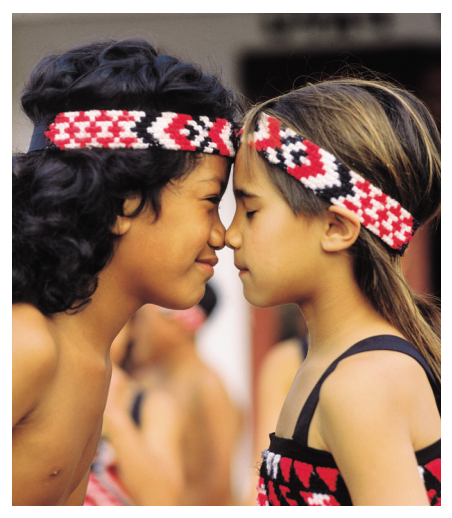
Feel the spirit of the Māori culture and traditions

The ultimate experience combining rail, coach and Doubtful Sound overnight cruise