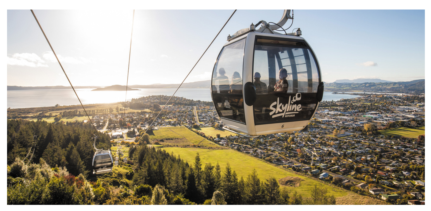
Enjoy the surrounds and activities on offer at Skyline Rotorua Gondola and Luge.

Witness the spectacular scenery of New Zealand during the Festive Season. On Christmas Day in Wellington enjoy a sumptuous dinner with all the trimmings. Celebrate an unforgettable New Year's Eve on your overnight cruise through the pristine beauty of Doubtful Sound. See in the New Year with new friends creating lifelong memories.