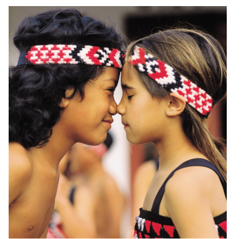
Feel the spirit of the Māori culture and traditions.

One of the great train journeys of the world. Depart Christchurch and travel through the patchwork farmlands of the Canterbury Plains, view alpine scenery, river valleys and spectacular gorges as you ascend to Arthur's Pass located in the centre of the Southern Alps.