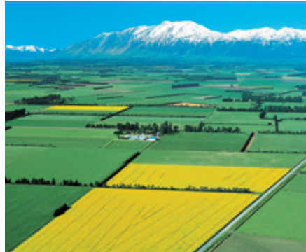
CLOCKWISE FROM TOP LEFT: Cruise aboard the vintage steamship TSS Earnslaw to Walter Peak; Agrodome, an educational hands on experience; the patchwork plains of the Canterbury region; Waitangi Treaty Grounds.