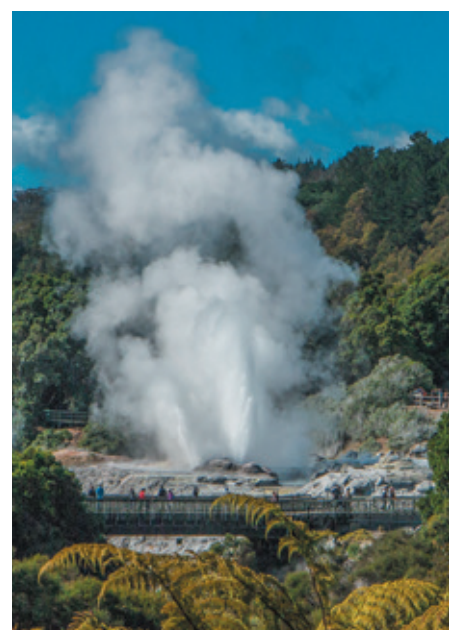
TOP TO BOTTOM: An optional trip Cape Reinga is available; Sculptureum, a unique art experience; discover the traditions of Maori Culture; see awesome Geysers in Rotorua.